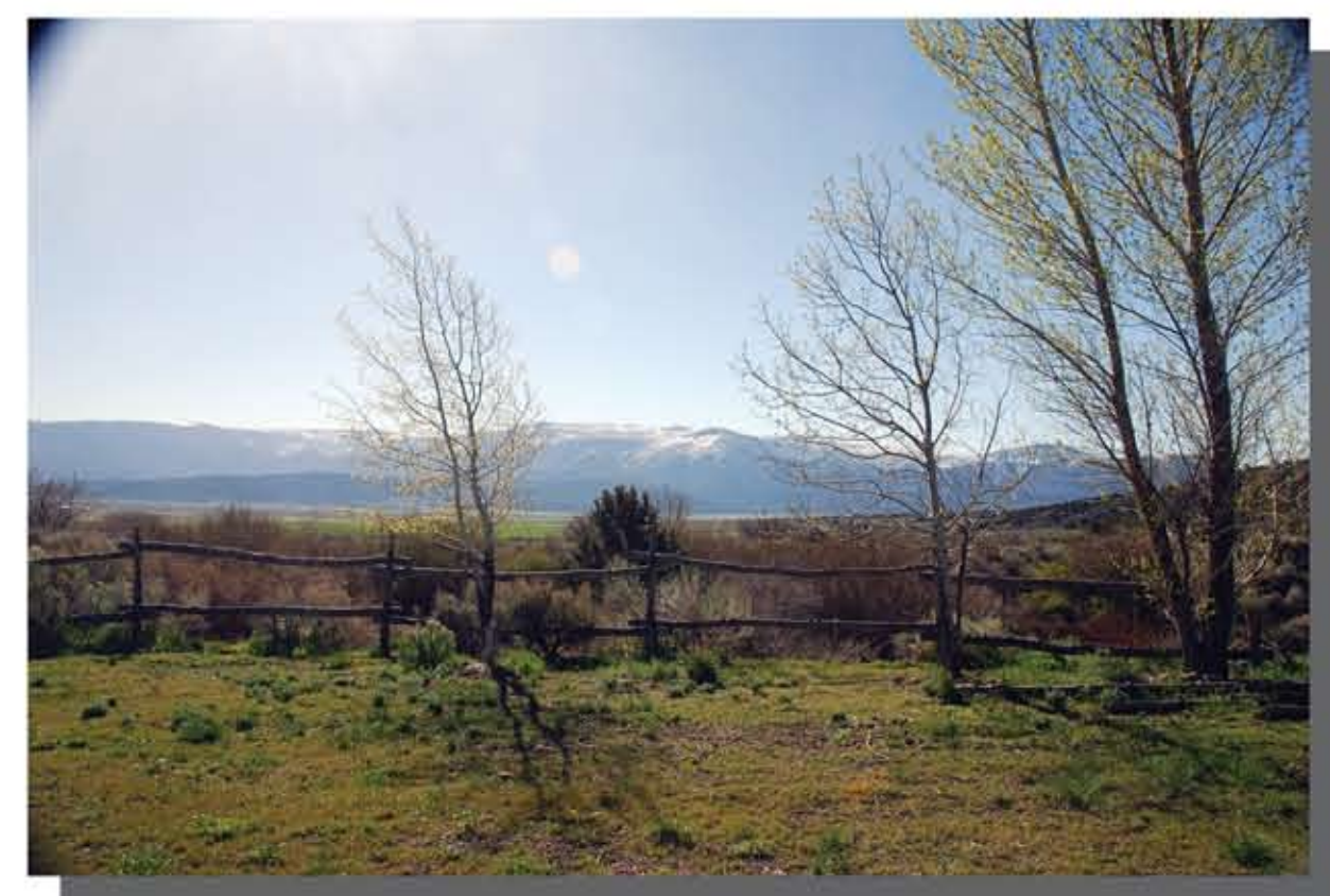
VIEW FROM SITE TOWARDS ZION NATIONAL PARK

A LIFE CHANGING EXPERIENCE FOR THE YOUTH IN OUR COMMUNITY THAT HE FOUGHT SO HARD TO PROTECT.